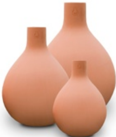
Olla irrigation GrowOya.com