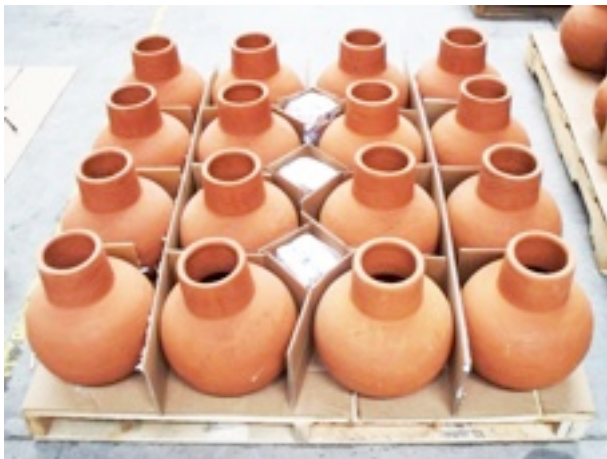
Olla irrigation www.drippingspringsollas.com