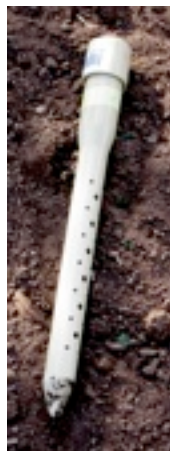
Deep pipe irrigation Deepdrip.com